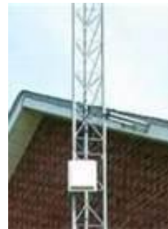
25G normally bracketed or guyed